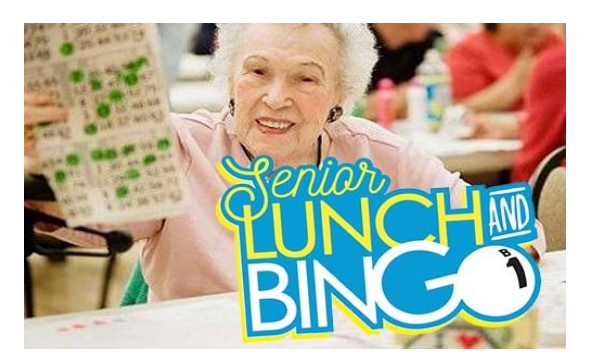
Senior Get Together Lunch/Bingo Friday, April 12

Mon, May 27— Memorial Day Church Office Closed